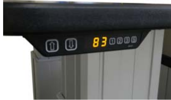
Optional position display with 3 memories (ref : BCHPOS)