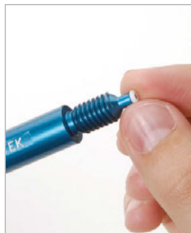
Place the O-ring over the tip of the tool.

Inserting an O-Ring (ASE 100/150/200/300/350 systems), using 2-in-1 Filter/O-Ring Insertion Tool Kit Tool Handle.