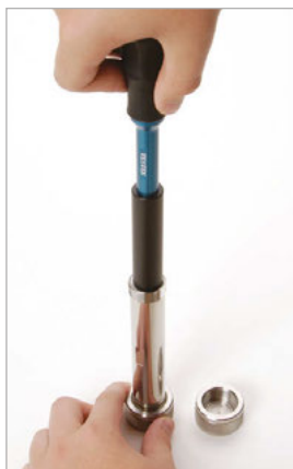
Place a filter at the top of the extraction cell.