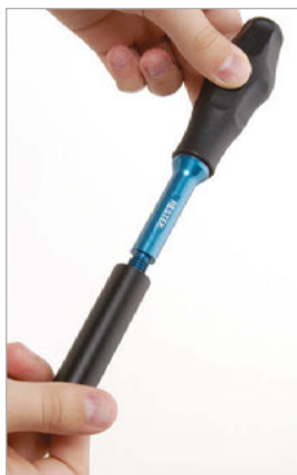
Screw the appropriate size attachment onto the end of the 2-in-1 Filter/O-Ring Insertion Tool Handle.

Inserting a filter (ASE 100/150/200/300/350 systems), using Filter Insertion Attachments on 2-in-1 Filter/O-Ring Insertion Tool Handle.