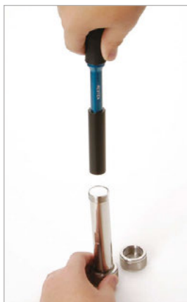
Push the filter to the bottom of the extraction cell.

Inserting an O-Ring (ASE 100/150/200/300/350 systems), using 2-in-1 Filter/O-Ring Insertion Tool Kit Tool Handle.